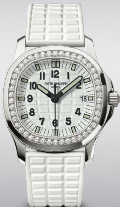
Aquanaut Luce Ref. 5067A