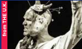
I, MALVOLIO JUNE 2–5, 2016

chicago shakespeare theater on navy pier