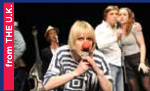
TWELFTH NIGHT MARCH 1–13, 2016 by William Shakespeare